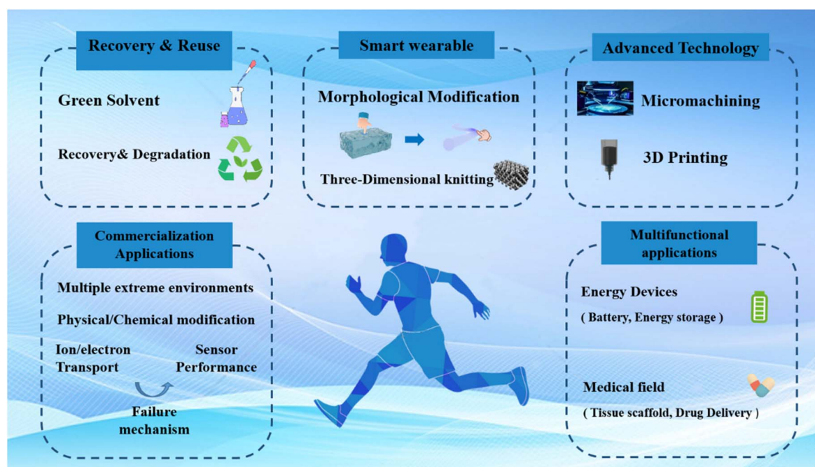
Fig. 16 Proposed future research directions for hydrogel-based flexible strain sensors operating under harsh environmental conditions.

(2) Enhancing the adaptability of strain sensors in extreme environments requires the integration of advanced technologies. The performance of hydrogel flexible strain sensors can be precisely tuned by combining frontier technologies such as 3D