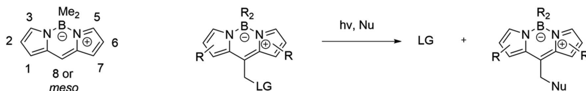
Scheme 5 General mechanism of photoconversion of BODIPYs into by-products and released drugs. LG – leaving group that in the observed cases is the drug and Nu – a nucleophile, usually solvent molecules. The overall mechanism may not correspond to all examples of photorelease.

The described compound includes an ester bond as a linker between the backbone of the molecule and the leaving group. Such a bond can be often enzymatically broken by esterases. 76,77 While compound 29 was not investigated for stability to esterases, compounds 30–32 were. 74 Compounds 30–32 include a fragment of the cysteine protease cathepsin B inhibitor with a broad scope of functions. 78,79 The authors tried to overcome resistance to esterases by varying the nature of substituents, which succeeded for 31 (Fig. 10). All compounds absorb light in the 400–550 nm range with a maximum of around 525 nm in