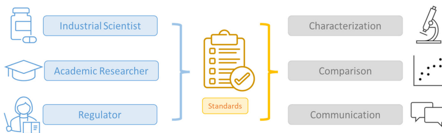
Fig. 1 Standards are developed as a result of the work of different collaborating stakeholders. Standards will help with characterizing and comparing different microphysiological systems, and with communication between stakeholders.

The working groups leading the efforts towards the development of MPS standards consist of stakeholders from academia, funding agencies, regulators, and industry. At the “Workshop on Standards for Microphysiological Systems” held at Michigan State University (USA) April 2023, the participants emphasized the importance of sharing results and ideas generated by different working groups. This workshop was organized by the OoC/ToC Engineering Standards Working Group (USA) and included members from the working group and other representatives from academia, industry, Food and Drug Administration (FDA), National Institute of Standards and Technology (NIST), National Institutes of Health (NIH), and