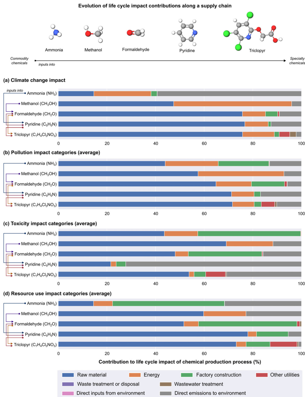
Fig. 5 Life cycle impact contribution profiles for the agrochemical product triclopyr and its precursors at various points in its upstream supply chain. Squares correspond to a feedstock materials into the process producing the indicated compound. Life cycle impact categories are grouped into four classifications – climate change, pollution, toxicity, and resource use. (a) shows contributions to climate change impacts; (b) presents contributions averaged over all pollution-related impacts (ozone depletion, particulate matter formation, ionising radiation, photochemical ozone formation, acidification, freshwater/marine/terrestrial eutrophication); (c) corresponds to average contributions to toxicity-related categories (freshwater ecotoxicity, non-carcinogenic and carcinogenic human toxicity); and (d) shows average contributions to resource use categories (land, water, minerals and metals, and fossil resource use).

impacts of material inputs represent relatively minor shares while more critical impact hotspots involve energy, direct emissions, and infrastructure/construction. Enhancements in the environmental performance of these hotspots in the upstream production will propagate to downstream processes. In general, strategies for the production of building block