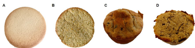
Fig. 1 Bakery products developed. (A) Control biscuit, (B) biscuit with 50% melon peel flour, (C) control muffin, (D) muffin with 100% melon peel flour.