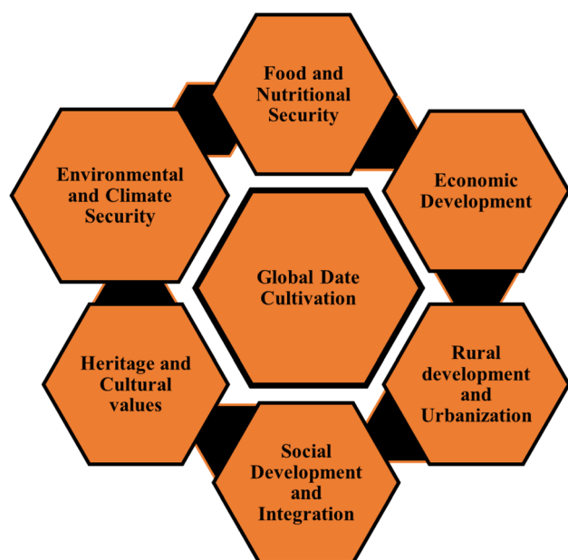
Fig. 1 Importance of global date cultivation.

Date fruits are the cornerstone of date palm products from an economic perspective, being consumed as fresh or dried whole fruits or processed into various food products, such as jams, syrups, sugars, jellies, juice, and pastes. 7,24,27 Physiologically, the date fruit is a one-seeded drupe enclosed in a fleshy