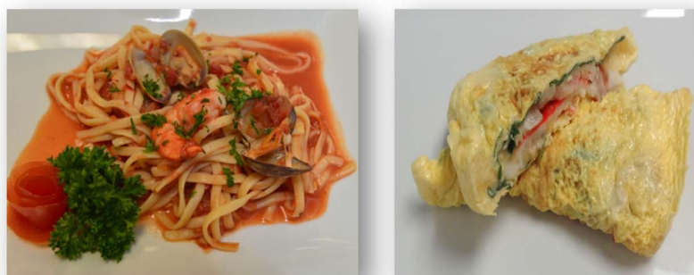
Fig. 2 Example of products after 90 °C-10 min processes using the MAPS at Washington State University.

preheating (using circulating water), microwave heating (by microwave and hot circulating water), holding (by hot circulating water) and cooling (using cold circulating water). 13 The microwave heating section consists of multiple connected single-mode 915 MHz microwave cavities similar to those illustrated in Fig. 1. 13,23 In operation, food packages are heated in the preheating section to about 90 °C, and then move through pressurized circulating water at above 121 °C while being heated by microwave energy. 13 The immersion water reduces microwave edge heating and improve heating uniformity. Deionized water is used to minimize the absorption of microwave energy in the circulating water and improves the overall energy efficiency of the system. 24 It typically takes 2–4 min, depending on package thickness, for the food packages to travel through the microwave heating section. 13,25 Food packages then travel through the holding section filled with circulation water at above 121 °C to achieve the desired commercial sterility before moving to the cooling section. Specially designed pressure-locks allow a continuous movement of the food packages from the ambient environment into and out of the pressurized MATS systems. 13 No steam venting and water drainage are needed in commercial operation with MATS, thus minimizing energy and water losses. 13 Protocols for regulatory acceptance ( i.e. , FDA and USDA FSIS) of novel thermal