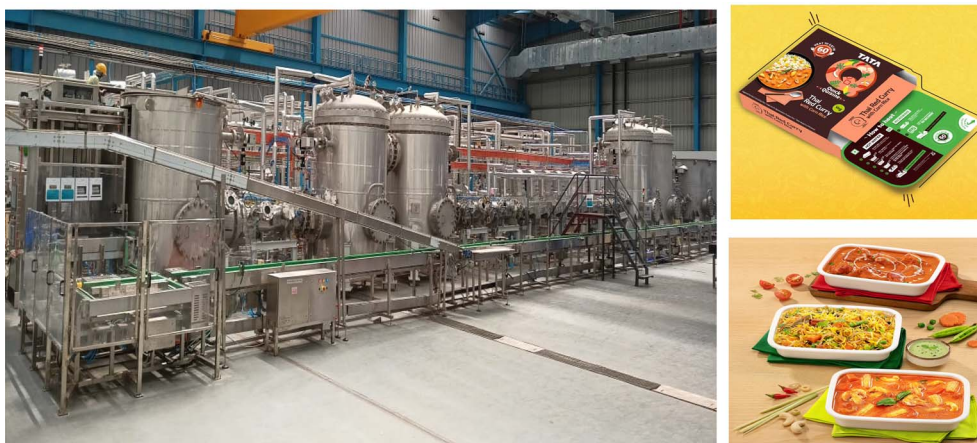
Fig. 3 Continuous MATS system in a TATA affiliated food processing plant (left) and shelf-stable meals produced by the company (right). 26