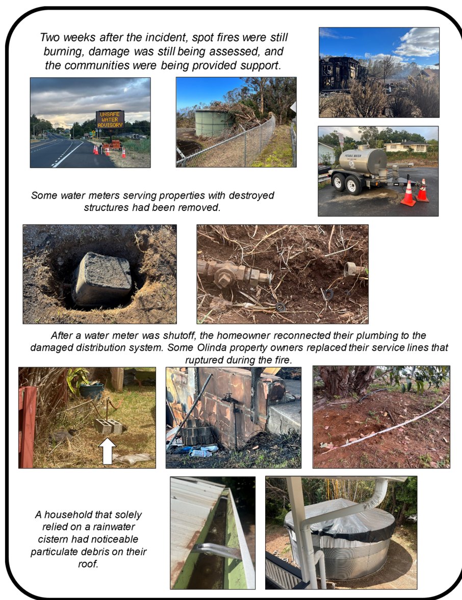
Fig. 2 Two weeks after the wildfire and the evacuation orders had been lifted, some fires were still burning, and various damage and household responses were observed.

The following results reflect our study's bias toward households affected by the Kula Fire: a majority of households that evacuated (7 of 11) either returned to their