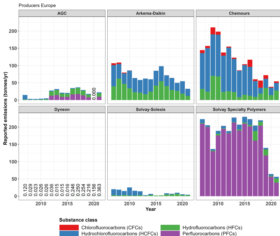
Fig. 2 Reported fluorinated gas emissions to the E-PRTR by European fluoropolymer producers. Note the missing data for AGC in 2020 and that there are some reported emissions for Dyneon but, as they are much lower than for other producers, the bars are barely visible and therefore the sum of emissions are shown per year.

The data from the French emission registry on the municipality level of the location of the factories in Tavaux (Solvay-Solexis) and Pierre-Bénite (Arkema-Daikin) also show decreases in fluorinated gas emissions in the reported years 2004, 2007 and 2012 (ref. 34). These data are over a decade old and provide only a few datapoints and thus are not likely to represent current emissions. Additionally, not all fluorinated gases were reported (HCFCs are notably missing) and only three years of data are present in the database. Considering these discrepancies, the emissions of HFCs from Pierre-Bénite reported to this database in 2007 and 2012 match the emissions reported to