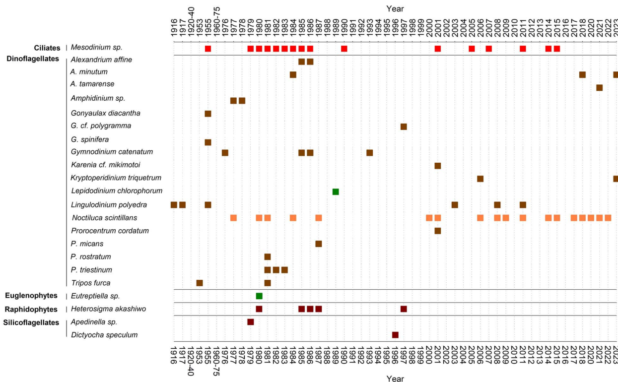
Fig. 4 Temporal distribution (year of occurrence) and responsible species for red tides in Galicia (NW Iberian Peninsula, Spain). No data available for the periods 1920–40 and 1965–75. Approximate colouring of the most recurrent ‘red tide’ forming species in the Galician rias is provided.

silicoflagellates ( Apedinella ), raphidophytes ( Heterosigma akashiwo ), and above all the ciliate genus Mesodinium . To the best of our knowledge, none of these blooms were associated with public health issues, harm to marine organisms and/or poor environmental quality. Among the dinoflagellates, Prorocentrum ( P. triestinum and P. rostratum ), Alexandrium affine and Gonyaulax ( G. spinifera and G. diacantha ) stood out until the 1990s as the species commonly associated with red tides.