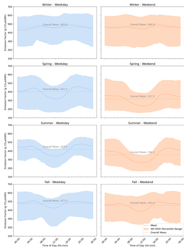
Fig. 8 Grid EF by day type, season, and time of day for the year 2021. The solid line represents the mean value for specific time points (e.g. 12:00 h), day type (e.g. weekday), and season (e.g. Summer). The shaded area delineates the range between the 5th and 95th percentiles of the data, highlighting the distribution's variability and indicating where 90% of the values lie for the given time and year. The dashed line represents the overall mean, i.e. , the daily mean for a given day type and season.

and around midday. However, the 'dip' at night becomes less pronounced and is barely detectable for the year 2022.