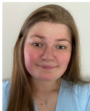
Morgan P. Deal

Beyond coordination number and geometry, hard-soft acid-base properties of ligands are another way to tune the properties of europium. Hard-soft acid-base theory is a way to predict and explain the general types of atoms that bond together. In essence, classifying an atom as either hard or soft is dependent on its polarizability, or its response to an electric field. 19 Trivalent europium, and other trivalent lanthanides, tend to be thought of as hard acids, but divalent europium is a much softer ion. Consequently, the types of donor atoms used for the two ions tend to be harder donors like oxygen, used more for the trivalent ion, and softer donors like nitrogen and sulfur, used for the divalent ion. The hard-soft properties of donor atoms affect the stability of Eu-containing complexes. For example, sulfur donor atoms shift the oxidation potentials of Eu II -containing complexes more positive. 20 The ability to tune the electrochemical properties of Eu-containing complexes is