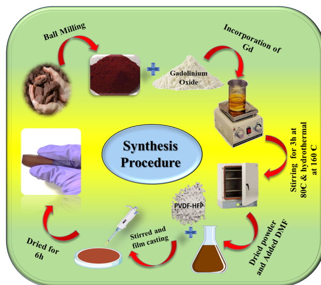
Scheme 1 Schematic representation of the synthesis procedure.

The synthesized nanocomposite membranes were characterized by several methods to study their properties. X-ray diffraction was performed using a Bruker AXS D8 (Wisconsin, USA) diffractometer to analyze the structural and microstructural evolutions of the synthesized samples. 18 The diffractometer with a Cu K \alpha target of 1.5418 Å was operated at a current of 35 mA and a voltage of 35 kV, and at a scan rate of 3 s per step. To investigate the physicochemical properties and the microstructural parameters of mechanically ground hematite, Rietveld refinement was performed by using the MAUD (Material Analysis Diffraction) v2.94 software package. 19 A standard cif file (crystallographic information file) for hematite (AMCSD file no. 1011240) was used for refinement of the experimental diffractograms. Primarily, the Caglioti PV function and Gaussian broadening were applied for calibration, and background parameters were also refined. It was found that the experimental diffractogram is well-fitted with promising fitting