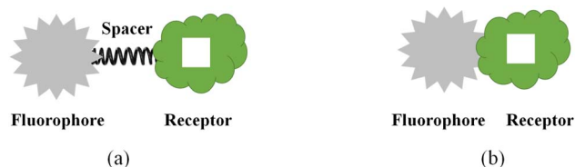
Fig. 3 Fluorescent sensor model (a) with and (b) without a spacer.

When the analyte binds to the guest acceptor, the photophysical properties of the sensor change through mechanisms such as photo-induced electron transfer (PET), intramolecular charge transfer (ICT), fluorescence resonance energy transfer (FRET), etc. 67–69