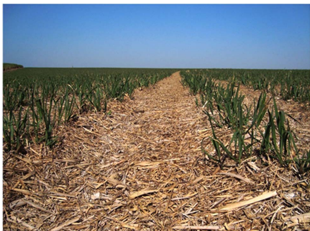
Fig. 39 Recent view of sugarcane cultivation under green cane management conducted without the preharvest burning in Brazil. The trade-offs between the need to preserve soil health and produce more bioenergy have been the subject of intense discussion, given that the adoption of sustainable management practices such as crop residue retention can increase the productivity of agricultural ecosystems and mitigate the effects of climate change through enhanced carbon sequestration. 174

crude palm oil. It was demonstrated that when PLA and crude palm oil were used as cross linkers, the strongest tensile strength of 5.24 MPa and lowest elongation at break of 3.49% were obtained. It was also elucidated that the strong interaction of triglycerides (C=O stretching) was observed for all 3 types of films. 182