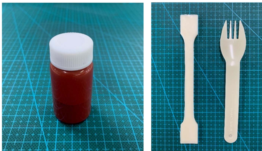
Fig. 35 Biomass biodegradable paint (Left) and plastic (Right) with anti-bacterial activity. 160

to act as scrub agents that eliminate dirt and dead skin from the body and also provide UV protection for cosmetics. These microscale particles are made of petroleum-derived plastics such as polyethylene (PE) and polypropylene (PP) and are the major cause of micro-plastic pollution because they are used in baths, showers, and bathrooms around the world daily in massive quantities and immediately flow into the drainage system after use (Fig. 36). 166