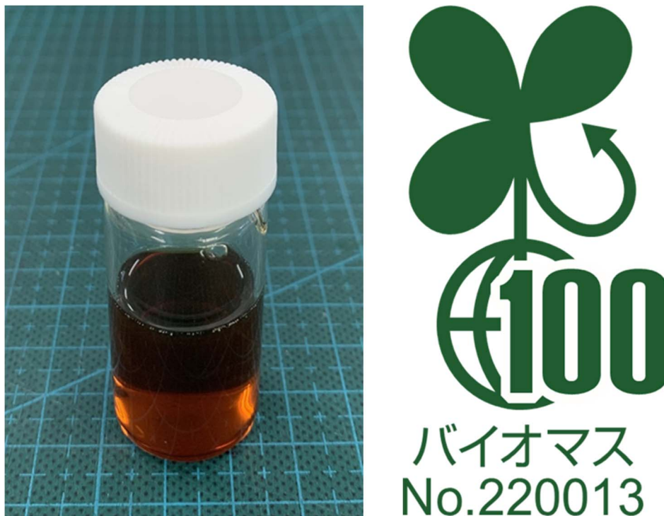
Fig. 27 (Left) 100% biomass mark certified water-based coating material. (Right) 100% biomass mark from JORA. 116