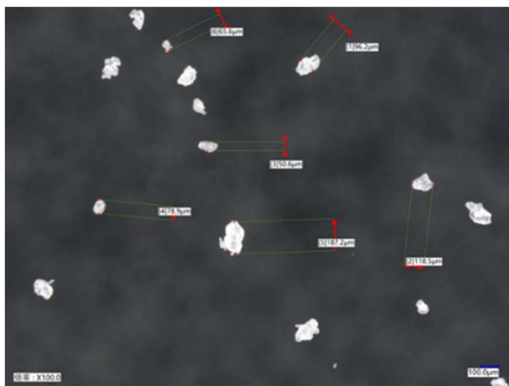
Fig. 37 Biomass biodegradable resin powder. (Top left) PLA base, (Top middle) starch base and (Top right) cellulose base. Optical microscopic observation of PLA-based 100% biomass biodegradable resin powder (Below).

addition, some chemical products such as ethylene and polyethylene can also be prepared from ethanol. Nowadays, bio-ethanol is produced from agricultural products such as corn, sugarcane, and starch-based materials. 173 However, these edible biomass organic resources are not ideal because they compete with human nutritious foods 174 (Fig. 39). Therefore, it is preferable to source bio-ethanol from non-edible biomass-based organic resources such as cellulose, as explained above. Thus, bio-ethanol from non-edible organic waste biomass such as waste of plants, wood, paper, waste food, and bamboo has been developed. Specifically, anything that contains cellulose. For example, bio-ethanol has been prepared from waste wood, which contains cellulose, and called second generation bio-ethanol. 175–177 I also made bio-ethanol from bamboo residue using my bamboo particle dispersion technology, which was the pretreatment to enhance the following enzyme and yeast fermentation efficiency (Fig. 40). 178