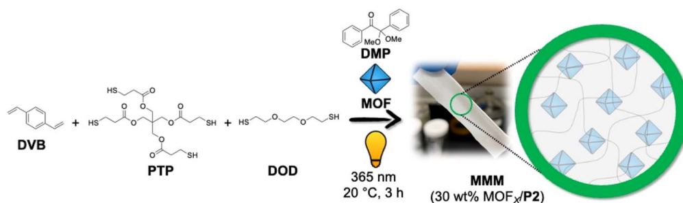
Fig. S5 Scheme for synthesizing P2-based (control, not self-healing) MMMs with 30 wt% MOF-loading using thiol-ene 'photo-click' polymerization.

Department of Chemistry and Biochemistry, University of California, La Jolla, San Diego, California, 92093, USA. E-mail: scohen@ucsd.edu