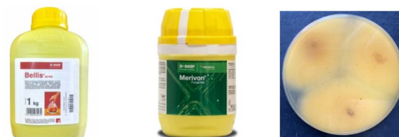
Fig. 4 Inhibition of growth of Aspergillus niger (strain VURV-F 822; measured as a diameter of the inhibition zone, mm) with boscalid, bixafen, fluxapyroxad, and their analogs 28–30 at different concentrations after 48 h of incubation. Fungicides boscalid (@Bellis) and bixafen (@Merivon) are shown. Inhibition of fungal growth by compound 29.

Lipophilicity. To estimate the influence of the replacement of the ortho -benzene ring with bicyclo[2.1.1]hexane on lipophilicity, we used two parameters: calculated lipophilicity (clogP) 27 and experimental lipophilicity (logD).