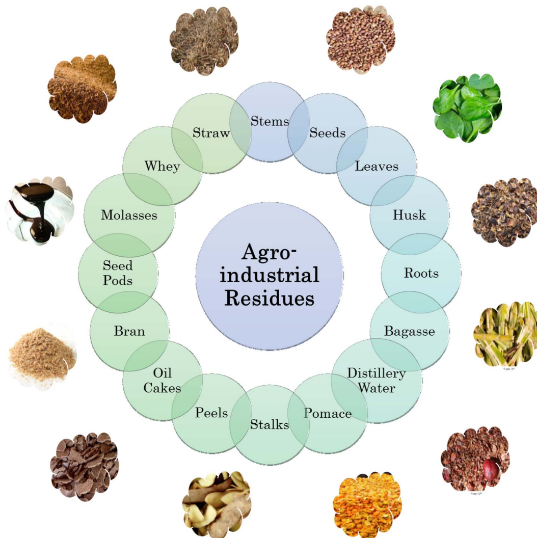
Fig. 4 Different agro-industrial residues used as substrate during biosurfactant production.

5.1.1. Vegetable oil and (oil) wastes. A large amount of waste residues formation occurs during the oil extraction in various oil industry. These left over products includes oil cakes, oil soap stocks, by-products rich in fat content, semisolid and water soluble effluents, fatty acid residues etc. 64