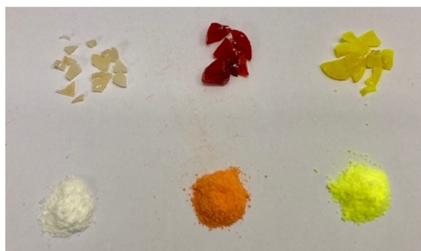
Fig. 2 ROCOP polymer samples; powdered products are shown below the corresponding melt-cast samples. From left to right, PA-CHO, AAQ-PA-CHO (0.2%), Nap-PA-CHO (0.2%).

a Conditions: [Ep] 0 : [Anh] 0 : [Al] 0 : [DMAP] 0 = 400:400:1:2 in toluene; conversion based upon anhydride signals in 1 H NMR spectra. Polymer was dried in a vacuum oven at 80 °C overnight. b 3.16 mmol 3 . c 6.4 μmol 3 . d molecular weights measured by triple-detection GPC. e No observable transition in the DSC data. f Ester signals observed but ether signals obscured by chromophore and so %ester cannot be determined reliably. g From the polymerization of PA and CHO obtained from the depolymerization of entry 2.