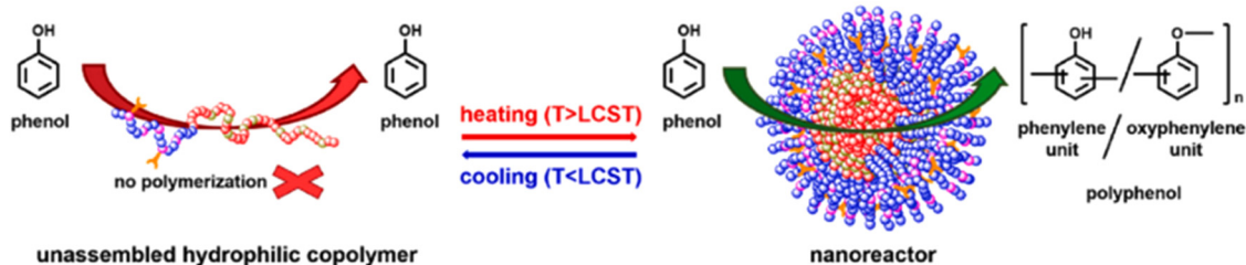
Fig. 3 Enzymatic polymerization of phenolic compounds catalyzed by HRP within nano-reactors of thermo-responsive diblock copolymer. Reprinted with permission from ref. 38. Copyright 2022 The Royal Society of Chemistry.

Herein, using the amphiphilic thermo-responsive diblock copolymer PNIPAM- b -PS 17 as an example, we discuss the thermo-responsive behavior of this type of thermo-responsive diblock copolymer, schematically shown in Fig. 4. When the temperature is lower than the LCST, the PNIPAM chains are in the hydrophilic state. At this point, diblock copolymer nano-assemblies with the PS block as the core and the PNIPAM block as the corona are formed and uniformly dispersed in water. When the temperature increases above the LCST of the PNIPAM block, the PNIPAM chains become insoluble and collapse to the PS core surface, leading to aggregation of the nano-assemblies and then precipitation in water. Dispersion and aggregation of the PNIPAM- b -PS nano-assemblies are reversible by regulating the temperature. When the temperature decreases below the LCST, the PNIPAM- b -PS nano-assemblies are uniformly dispersed into water again.