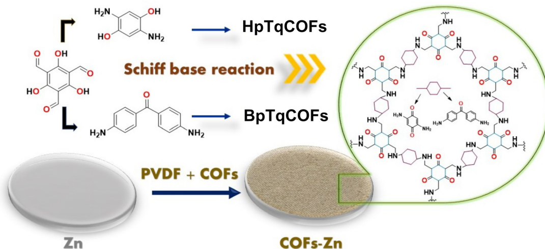
Fig. 1 Scheme of structures and the preparation of COF layers: HqTpCOF and BpTpCOF as ASEIs on the Zn anode in AZIBs.

Little research has been conducted using COFs as layers to form an ASEI on the Zn anode in ZIBs. In this work, we propose a COF structure, which provides a uniform flux of Zn^{2+} and limits Zn dendritic growth. The COF's layer consists of ketone (C=O) and imine (N-H) functional groups. The COF's layer is coated on the surface of the Zn anode as a protective layer between the Zn metal and the electrolyte. In Fig. 1, it is seen that the COF layers are generated by a condensed reaction between 2,4,6-triformylphloroglucinol (Tp), 2,5-diaminohydroquinone (Hq) and 4,4'-diaminobenzophenone (Bp). The two COFs (denoted as HqTpCOF and BpTpCOF) in this work provide suitable coating films, which have the following advantages: (1) C=O and N-H in the struc-