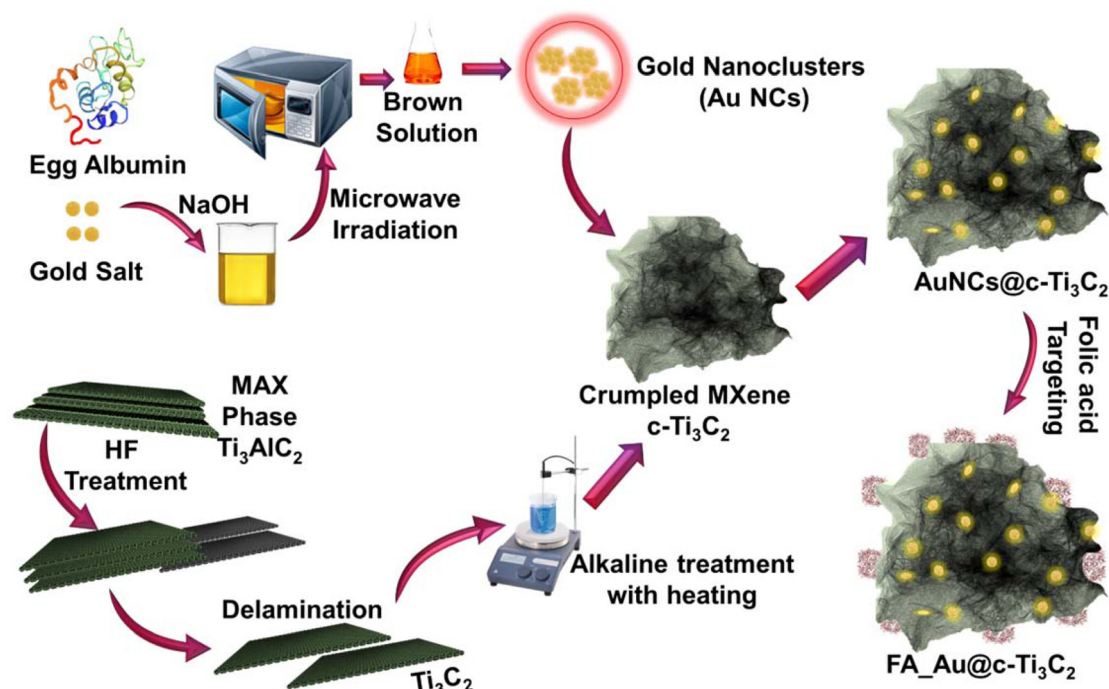
Scheme 1 Synthesis procedure of the folic acid conjugated MXene gold composite (FA_Au@c-Ti 3 C 2 ).