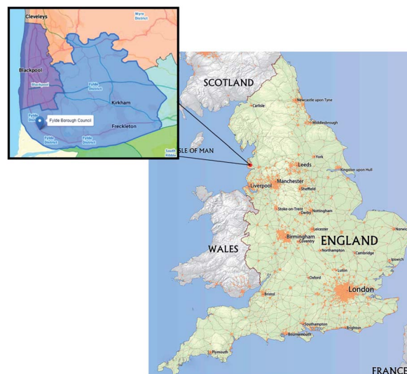
Fig. 1 Map of Fylde district council: the blue-shaded parts in the map indicate the area covered by Fylde. 20,21

Fylde is predominantly a rural area with a smaller urban area. It is one of the top hot spots for tourism experience as it is enriched with pretty villages, wetlands, seaside, canals, and dune areas; 22 hence providing countryside adventures, such as horse riding, walking, cycling, and canoeing. Fylde is very rich in sporting culture, and it is known for its golfing tradition. 23