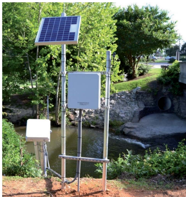
Fig. 1 Image of Smith Branch watershed (SMIA) monitoring station.

A real-world application case study is presented to demonstrate effectiveness and highlight future needs related to near real-time event detection in watersheds. This case study focuses on the Smith Branch watershed, which is a 6.5 square mile area on the western edge of downtown Columbia, SC (see Fig. 3). The upstream station, SMIA (see Fig. 1), where CANARY was implemented, was located in Earlewood Park, while the downstream station, SMIB, was located where a utility right-of-way crosses the creek off of Mountain Drive. Earlewood Park is home to Earlewood Community center where community members often hold meetings. The high pedestrian traffic at this location provides opportunities for educating the public on stormwater quality. The larger Lower Broad River watershed, which includes the Smith Branch watershed, is under a TMDL for fecal coliform bacteria. The primary objective for the City's monitoring program