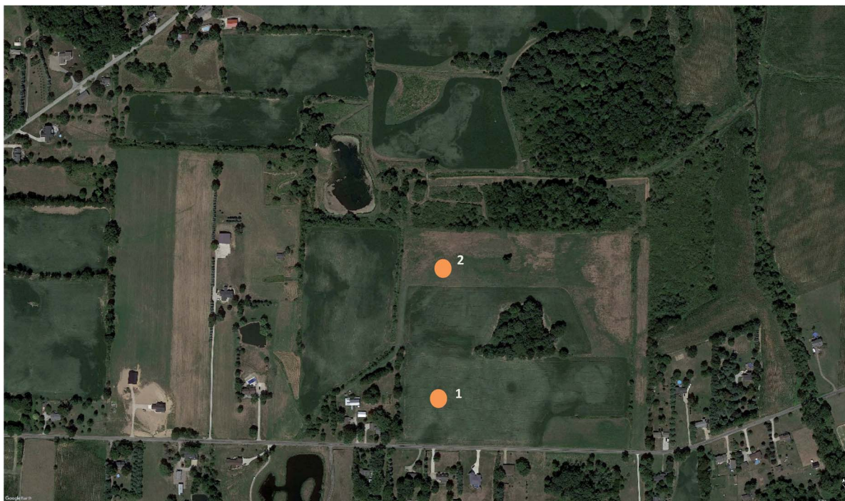
Fig. 2 Aerial photograph showing mixed agricultural, forested, and residential patches surrounding study sites 1 and 2; Portage County, Ohio USA.

Individual management units (fields) are typically less than 20 hectares. Site 1 is located in a reduced-tillage, annually cropped field consisting of Chili loam soils 2 to 6 percent slopes. 24 Site 1 contained grain corn ( Zea mays ) drilled May 2021, cereal rye ( Secale cereale ) cover crop in Winter 2021 and Fall 2020 (herbicide terminated), following harvest of grain soybean ( Glycine max ) in late summer 2020. Prior to broadcast cover crop planting, soybean residue was distributed by a Salford RTS vertical tillage implement. This site contained cereal rye cover crop in fall 2019 and grain corn during summer 2019. Both corn stalks and soybean stem residues were visible on the soil surface during 2021 data collection. Site 2 is located approximately 200 m north of Site 1 in an untilled, regularly harvested, hay field consisting of Jimtown loam soils 2 to 6 percent slopes. 24 Both sites were unshaded by other vegetation or structures during data collection timeframe of 10:00 to 16:00 Eastern Time zone.