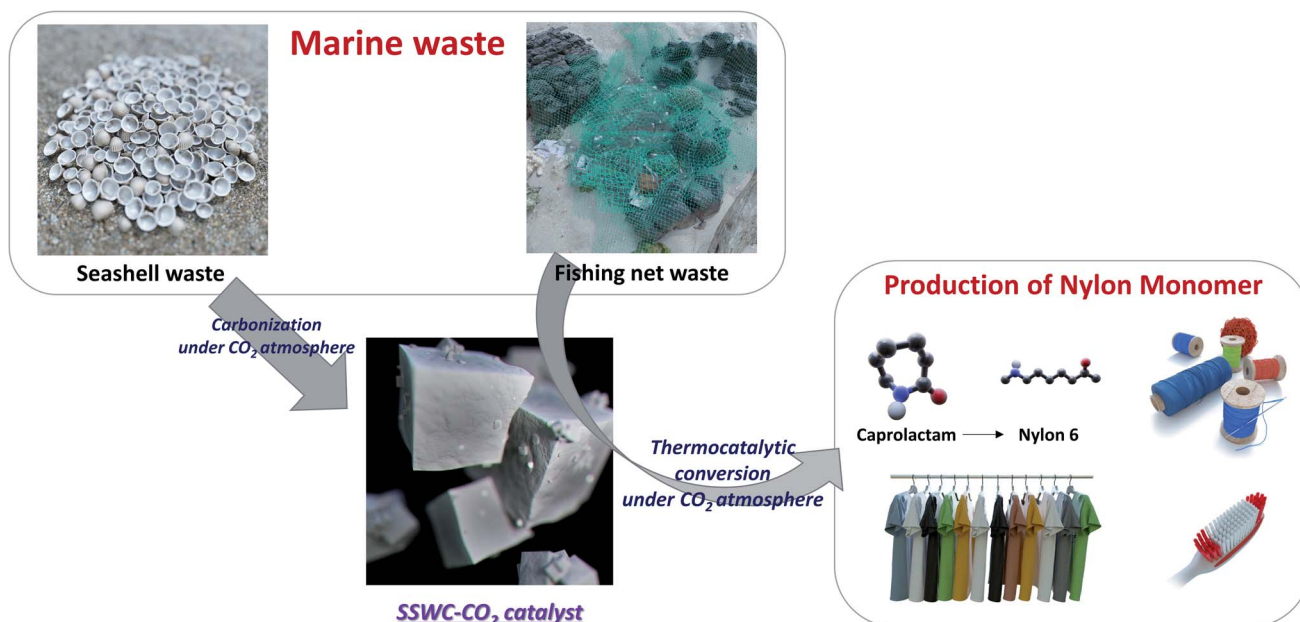
Fig. 1 Conceptual diagram of marine waste upcycling proposed in this study.

The preparation of catalysts from waste materials is another waste-upcycling method. Utilizing waste materials to prepare