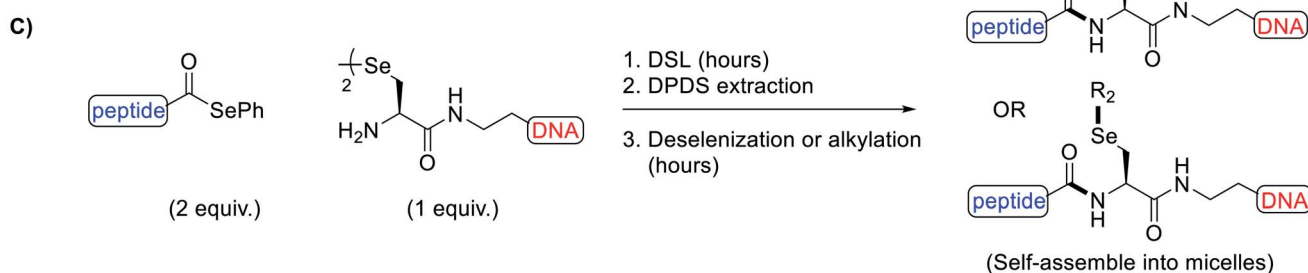
Fig. 1 Methods for the chemoselective amidation of biomolecules. (A) Native chemical ligation to generate peptide-oligonucleotide conjugates bearing a free thiol. (B) One-pot diselenide-selenoester ligation–deselenization to generate native or post-synthetically modified proteins. (C) One-pot diselenide-selenoester ligation–deselenization/alkylation to generate peptide-oligonucleotide conjugates or micelles (bonds formed are shown in bold; Bn = benzyl; Ph = phenyl; t -Bu = tert -butyl; DPDS = diphenyl diselenide; R 1 = H or amino acid side chain; R 2 = decyl chain).