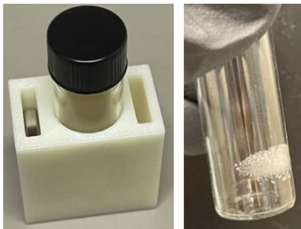
Fig. 2 Left: 3D printed holder containing the binary mixture of RE elements at 2 mm distance to a \text{Fe}_{14}\text{Nd}_2\text{B} magnet. Right: Crystals formed near the magnet after holding the binary mixture solution at the magnet for 72 h at 3 °C.