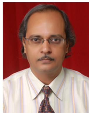
Surya Kant Tripathi