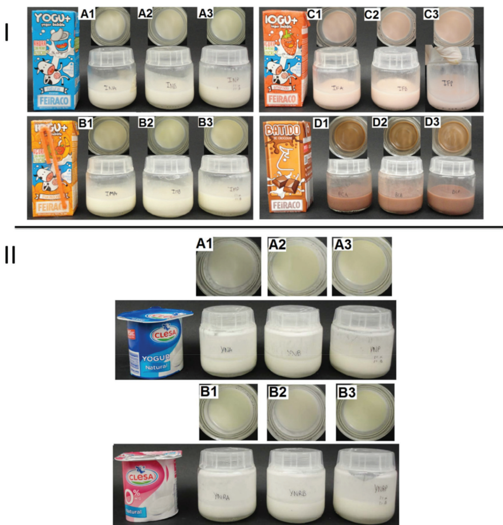
Fig. 3 Different emulsion appearances of the 40% of the RDA (EPA + DHA) from fish oil with 10 mM \alpha -CD and 9 mM \beta -CD in the product tested. I-A natural milkshake, I-B fruit salad milkshake, I-C strawberry milkshake, I-D chocolate milkshake whole milk, II-A natural yogurt, and II-B 0% natural Yogurt; control (A1–D1), 20% EPA + DHA from fish oil (A2–D2) and the 40% of the RDA (EPA + DHA) from fish oil plus 1% vanillin (A3–D3).

CDs created a powder. The addition of honey and maltodextrins increased the viscosity, density, and stability. The new product remains stable for 3 months at 4 °C. Finally, the addition of the Milk-similar food model (0.1 M phosphate citrate at pH 6.51) mixing for 15 min solubilized the previous aggregation and the solution remained stable for 1.5 months at 4 °C. The sensory panel generally approved and liked the products (8/10).