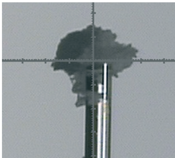
Fig. 1 A very small amount of powder (ca. 0.01 mg) mounted on the top of a glass fibre in the single crystal X-ray diffractometer. Each major tick represents 0.1 mm.

Fig. 2 shows that whilst the SDPD-SX data are in generally good agreement with the capillary PXRD data, they do not exhibit as good instrumental resolution. This, coupled with the \text{CuK}\alpha_2 contribution leads to a higher degree of reflection overlap, limiting the accuracy with which individual reflection intensity information can be extracted. Despite this, the crystal structures obtained using DASH are in predominantly very good agreement with their known SX counterparts; DFT-D optimisation confirms this high level of accuracy in the solved structures (see Fig. S15–S28†). The relatively low real-space resolution of the SDPD-SX datasets is therefore not a serious impediment to structure solution using a global optimisation approach such as the one implemented in DASH and subsequent Rietveld refinement is straightforward (see Fig. S29–S31†) with results in good agreement with those obtained from