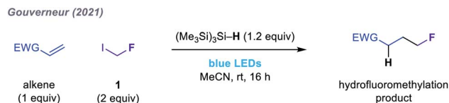
Fig. 2 Hydrofluoromethylation of electron-deficient olefins using 1 . 49