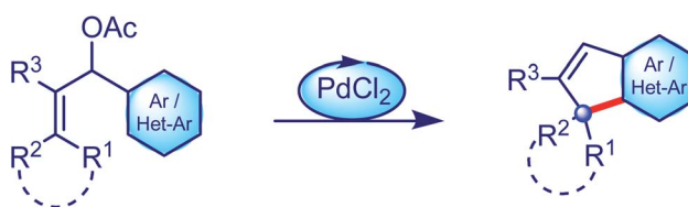
Scheme 1 General representation of the palladium-catalysed intramolecular allylic (hetero)arylation strategy reported by our group.

After the publication of our manuscript, a reader suggested that the transformation (shown in Scheme 1) can also be described as a Nazarov-type cyclisation 1 with palladium chloride acting as a Lewis acid. While we do not have any evidence at this stage to support the Lewis acidic behaviour of palladium chloride, 2 however, a Nazarov-type mechanistic scenario is possible. The overall transformation can also be considered as an intramolecular ene-type reaction 3 or as an intramolecular Friedel-Crafts-type reaction, 4 although our data agrees better with the 5-endo-trig process facilitated by the LUMO umpolung. 5 Further experimental and computational investigations are underway to elucidate the full mechanistic details.