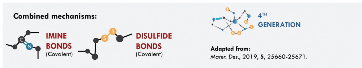
Fig. 9 Imine and disulfide metathesis in PU. 187

between mechanical performance and healing capability. However, in most cases the healing procedure applies high temperatures ( > 60 °C). Thus, room temperature self-healing is still a milestone to overcome in the development of high performance PU.