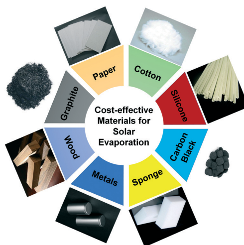
Fig. 11 The cost-efficient materials that are used in solar evaporation, including low price photothermal materials (carbon black and graphite), cellulose-based hydrophilic substrates (paper and cotton), and effective floating supports (wood and sponge).

Prof. Liangbin Hu's group reported a series of novel solar steam generators made of natural wood. 71 The top layer of the wood was coated with graphite to receive the solar energy, and the water was transported to the top layer based on the wood lumens (Fig. 13a). Due to the well-arranged water channels in the wood lumens, the efficiency of water transport was promising (Fig. 13b). Besides, the thermal energy was concentrated on the vapor generating surface owing to the anisotropic thermal conductivity and the thin graphite layer. The anisotropic structure decreases the conductive heat loss, because the preferred thermal transport direction and the liquid transport direction are decoupled. Importantly, the selection of natural wood can largely reduce the cost of the solar evaporator, and can also provide a possible method for fabricating such evaporators on a large scale (Fig. 13c).