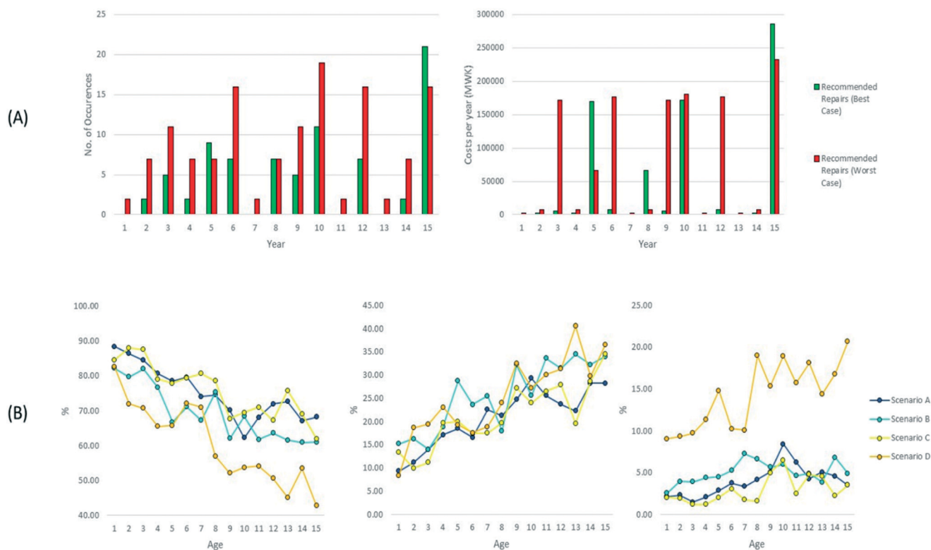
Fig. 1 (A) Number of replacements over 15 year design life (left) and proxy cost of replacements each year (right). (B) Functionality (left), partial-functionality (middle) and non-functionality (right) of scenarios over the 15 year design life of the Afridev.

A gradual increase in the number of recommended replacements occurs before a marked increase in the worst