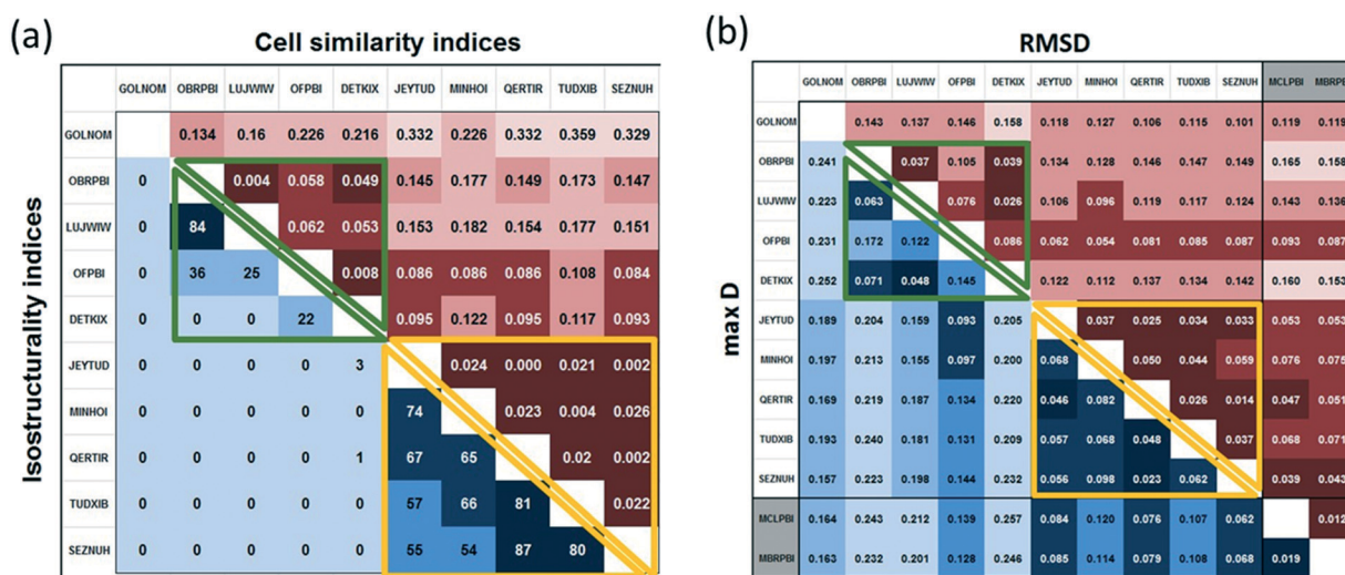
Fig. 10 a. Cell similarity ( \pi ) and isostructurality ( I_s ) indices calculated for the halogenated 2-phenylbenzimidazole structures crystallized in the Pbca space group. b. Molecular isometricity calculations. 31 rmsD and maxD values for all the halogenated 2-phenylbenzimidazole structures. Header of the P2 1 /c structures are highlighted in grey. Calculated values belong to group 2 structures are framed with green lines, and values belong to group 3 structures are framed with yellow lines.

Kitaigorodskii packing coefficients (KPI) 32 were calculated for the crystals of the 2-phenylbenzimidazoles derivatives. The KPI values correspond with the supramolecular interaction patterns, e.g. group 2 and 3 structures separate well (Table 1).