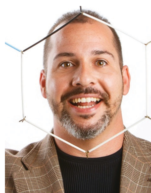
Luis Miguel Azofra

Ellman's sulfinamide represents as an industrially relevant reagent, frequently used as an ammonia surrogate in the synthesis of enantiopure primary amines. 11 This transformation typically requires three chemical steps, i.e. , stoichiometric