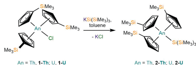
Scheme 1 Synthesis of 2-An by the reaction of 1-An with KSi(SiMe 3 ) 3 .

Single crystal XRD data reveals An–Si bond lengths of 3.1191(8) Å ( 2-Th , Fig. 1) and 3.0688(8) Å ( 2-U , Fig. S23, ESI†), which are both ca. 0.2 Å longer than the sum of single bond covalent radii reported by Pyykkö of 2.91 Å for Th–Si and 2.86 Å for U–Si. 35 Complex 2-Th exhibits the first structurally authenticated example of a Th–Si bond, but we note that the U–Si bond length of 2-U is 0.03 Å shorter than that found for the only previously reported U(IV)–Si bond in [U{N( t Bu)(C 6 H 3 Me 2 -3,5)} 3 {Si(SiMe 3 ) 3 }] (3.091(3) Å), 14