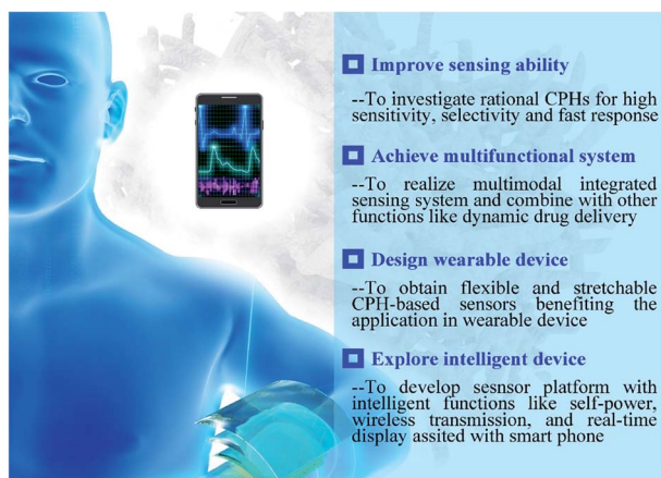
Fig. 7 Outlook of the future development and investigation of CPH-based sensor technology. Future development of CPH-based sensor technology lies in the improvement of sensing functions (improving sensing abilities and achieving multifunctional sensing systems as well as other novel functions) and broadening of the application form in daily lives (developing wearable devices and realizing self-powered/wireless sensors).

In conclusion, the CPH stands out as a promising platform for various sensor technologies benefiting from the unique combination of the intrinsic merits of hydrogels and organic conductors. The nature of the hydrogel structure such as hydrophilicity, porosity, and biocompatibility serve as a solid framework for multi-component systems, which further increase the diversity of properties and functions of the CPH platform. On the basis of CPH's highly tunable 3D network, introducing dopants is an effective method that greatly enhances the CPH's interchain electron/ion conductivity benefiting from the ordering of the polymer chains and the conductive dopant molecules, as well as increases the mechanical strength and stabilizes the hydrogel matrix. In