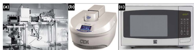
Fig. 6 Schematic illustration of (a) the single-mode microwave system, reproduced from ref. 38, with permission from Elsevier, 2006; (b) laboratory microwave oven, reproduced from ref. 56, under the license of CC BY 4.0; and (c) domestic microwave oven, reproduced from ref. 57, under the license of CC BY 4.0.