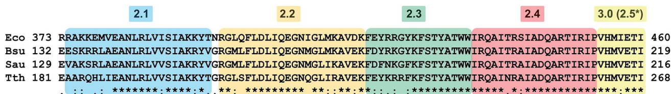
Fig. 2 Sequence alignment of region 2 of SigA. The protein sequences were obtained from NCBI and aligned using Clustal Omega ( https://www.ebi.ac.uk/Tools/msa/clustalo/ ). The regions were assigned according to Vassilyev et al. 18 *Region 2.5 was later named region 3.0 15 . The accession number of proteins used for the analysis are: Eco ( E. coli ): AAC76103.1; Bsu ( B. subtilis ): CAB14450.2; Sau ( S. aureus ): BAF67736.1; Tth ( Thermus thermophilus ): BAD70355.1. The D201 position is indicated by an arrow.

All the chemicals and reagents used in this study were of analytical grade. GPI0363 was obtained from the chemical library of the Drug Discovery Initiative at the University of Tokyo and its purity was confirmed by ultra-performance liquid chromatography-high