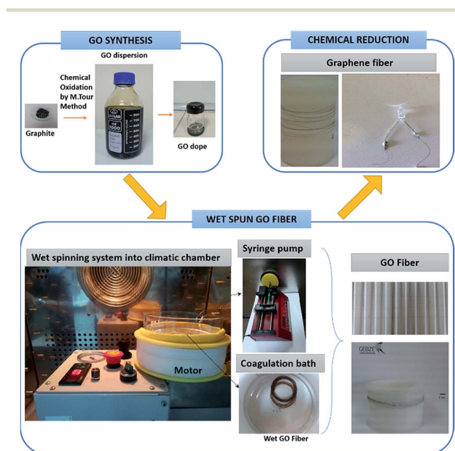
Fig. 1 Wet-spinning system to obtain GOFs and GF filament from graphite.