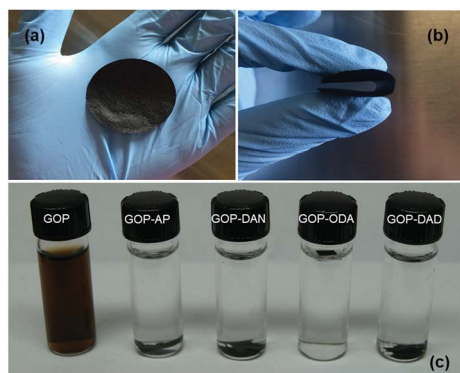
Fig. 2 GOP samples obtained (a) which can be folded without breaking (b). (c) Dispersibility test for pristine and amine-functionalized GOP samples in water after 10 min sonication. After three months, the functionalized samples remained without visible changes.

its surface. The paper can be folded and rolled without breaking or fracturing, suggesting that the individual GO sheets within the paper form uninterrupted networks, which provides the paper material high structural and mechanical stability. The mat thickness as determined by SEM can vary in the range of 16–30 \mu\text{m} (see below).