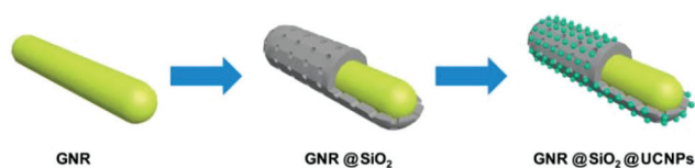
Scheme 1 Schematic illustration of the synthetic procedure for the preparation of the GNR@SiO 2 @UCNPs nanocomposite.