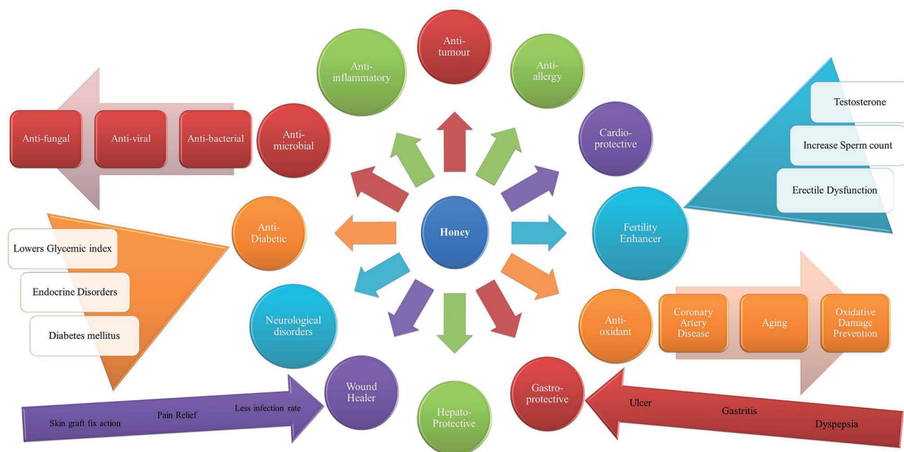
Fig. 1 Some uses and biological effects of honey.

Mad honey is employed for various purposes, which are different from those of regular honey. It is used as an alternative medicine used for hypertension, diabetes (hyperglycaemia and related complications), flu, gastrointestinal disorders (peptic ulcers, gastritis, dyspepsia, indigestion, bowel disorders, and other discomforts), abdominal/gastric pain, arthritis, stimulating sex (dysfunction, impotence, enhancement, and performance), various viral infections, skin ailments, pain, and cold. 29,41,43,47,50,52–56,132 The antiradical bioactivities, such as antidiabetic, anti-inflammatory, antioxidant, analgesic, antimicrobial, cytotoxic, and insecticidal, of Rhododendron species are also well established. 53,57–63 Silici et al. 64 reported chlorogenic, coumaric, ferulic, and gallic acids to be the main phenols in mad honey. Silici and Karaman 65 reported arginine, lysine, and aspartic acid to be the main amino acids in mad honey. Buratti et al. 66 reported that mad honey has the highest level of antioxidant activity among other types of honey. Mad honey is also used as a weapon. 69,84,135,136