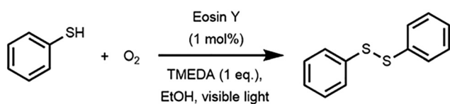
Scheme 1 Dimerization of thiophenol to diphenyl disulfide via photocatalytic aerobic oxidation with Eosin Y as photocatalyst.

Failure of continuous-flow processing can occur because of channel blockage due to solid precipitation. 32,33 Especially for microreactors, clogging remains one of the major hurdles for its widespread implementation. 34 In order to simulate microreactor clogging, we closed off one or multiple channels with plugs. Fig. 2 shows the weight distribution when the first photomicroreactor is blocked. Compared to the situation without channel blockage, all the non-blocked reactor channels experience an increase in throughput. The throughput especially increases in the channel which is paired to the blocked one. This is due to the decreased resistance in this particular section of the bifurcation zone. Interestingly, the