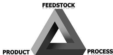
Fig. 1 Penrose triangle for a fossil-to-bio transition.

latest developments in science and technology that address those questions and challenges and create new opportunities.