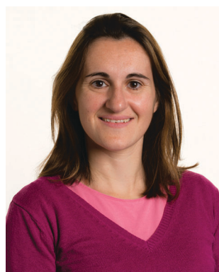
Antonia P. Sagona

b. In vivo methods. In vivo methods have been used for bacteriophage engineering involving marker-based or marker-less selections of genetically modified bacteriophages. The most