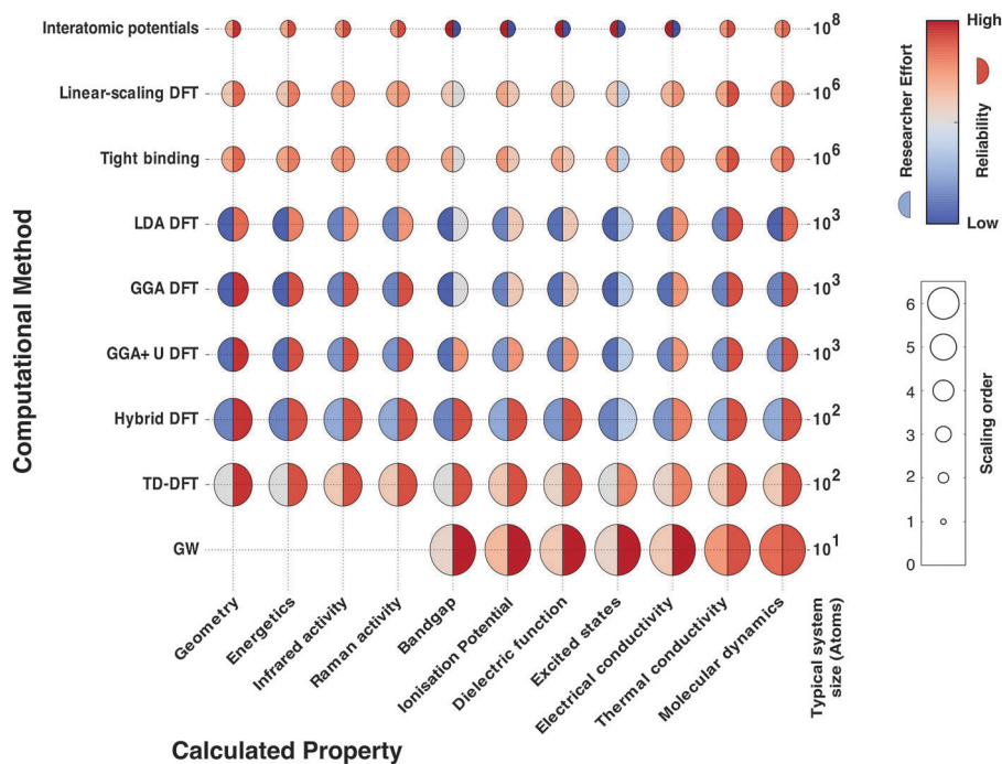
Fig. 2 Map showing the accessibility of different calculable material properties for a set of common computational methods. The methods include several flavours of density functional theory (DFT) which differ in the treatment of the quantum mechanical electron–electron interactions (e.g. local density approximation (LDA) and generalised gradient approximation (GGA)) as well as empirical tight-binding and many-body GW approaches. The circle size corresponds to the scaling of the computational effort with system size, the shading of the left semicircle represents the researcher effort required to use the method, and the shading of the right semicircle represents the reliability of the results from the method. Some properties are currently not calculable with GW theory for solids, and thus these circles are omitted.

material properties. Some useful descriptors for elements, crystal structures and properties are listed in Table 1.